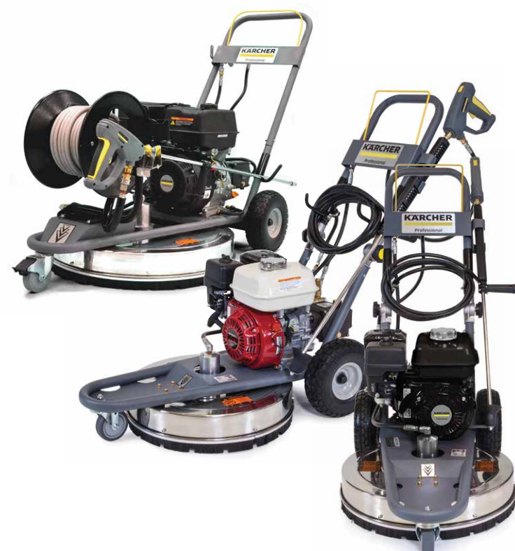
Jarvis 28" SCW 4.0/40 G (L) with Jarvis 21" SCW 2.4/25 G (Center) and SCW 2.4/25 CL (R)