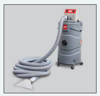
Inlet Connection fits included 50' of high temp 2" vac hose and scupper head, shown with optional caster wheel kit.

Plumb the Bulk Head Fitting to an auxiliary tank for larger volume recovery needs