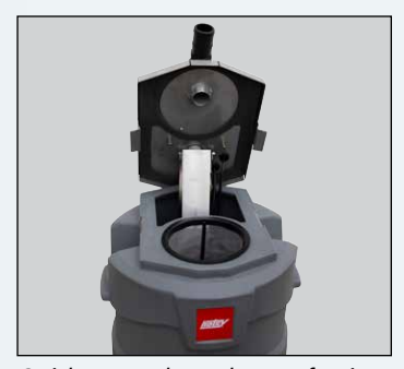
Quick access through top of unit to Filter Basket to catch solids

Integrated Molded Handles provide a solid grip and easy loading and transportation